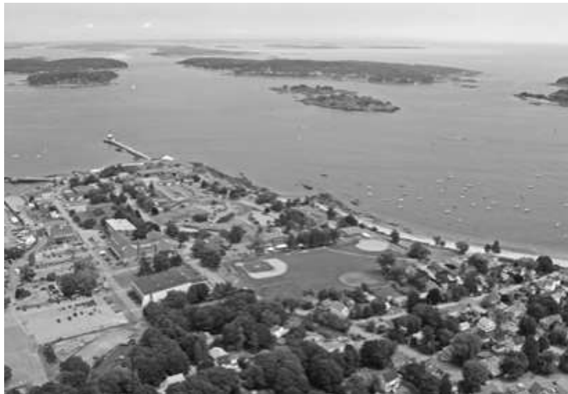
Southern Maine Community College Campus