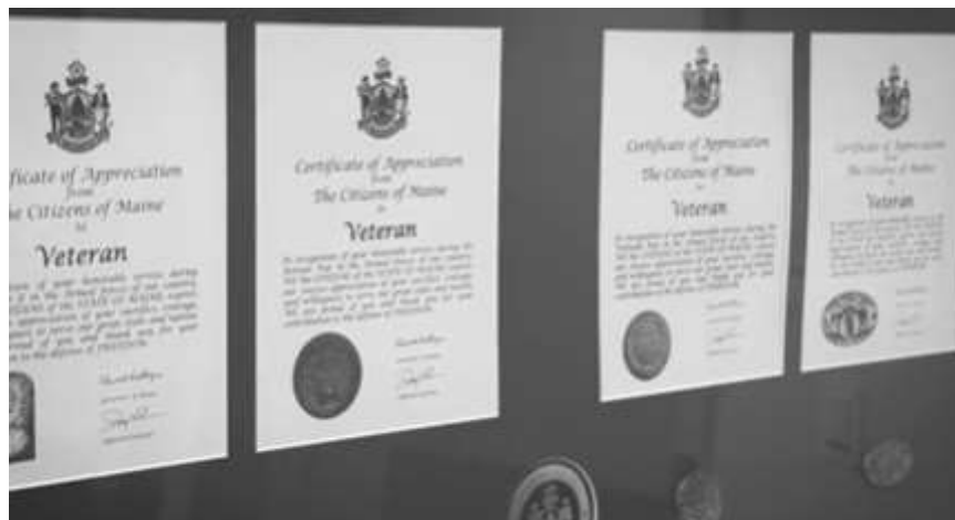
Honoring Maine Veterans

Maine Bureau of Veterans Services: http://www.maine.gov/veterans