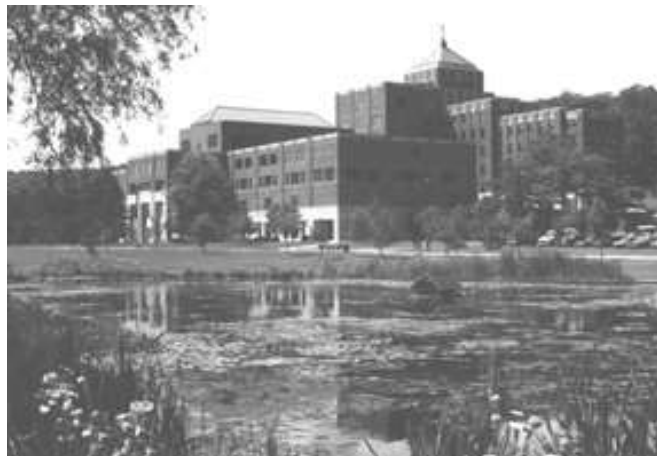
USVA Togus: The nation’s first federally-chartered veterans’ hospital

If you’re a current or former member of the Reserves or National Guard, you must have been called to active duty by a federal order and completed the full period for which you were called or ordered to active duty. If you had or have active-duty status for training purposes only, you don’t qualify for VA health care.