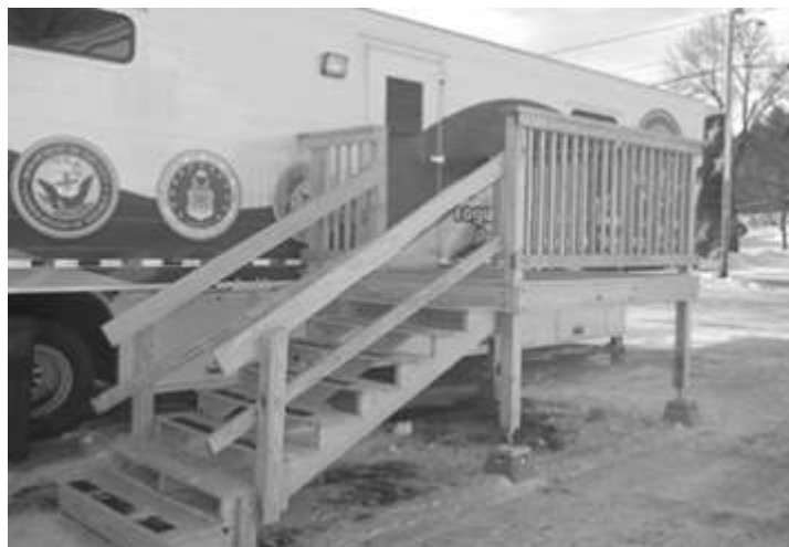
The Bingham, Maine Access Point Mobile Clinic

Checking Accounts (“Share Draft” accounts at credit unions) are transaction accounts —