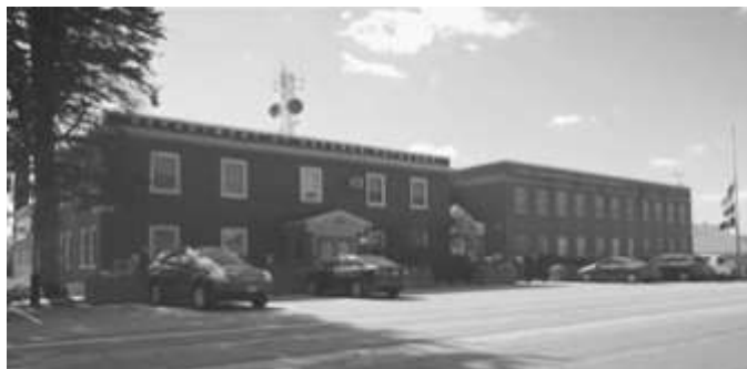
MBVS Office, Augusta, ME