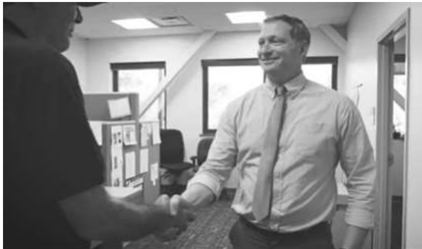
MBVS staff serving a Maine veteran.

“Other services may be provided to assist veterans in starting their own businesses, or independent living services for those who are severely disabled and unable to work in traditional employment.”