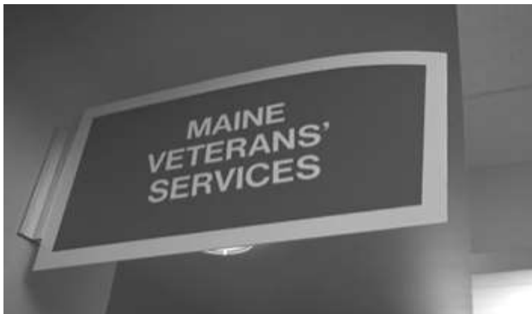
MBVS Office, Augusta, ME

Bureau of Rehabilitation Services Administrative Office 150 State House Station (45 Commerce Drive) Augusta, 04333-0150 (207) 623-6799 http://www.maine.gov/rehab/offices.shtml