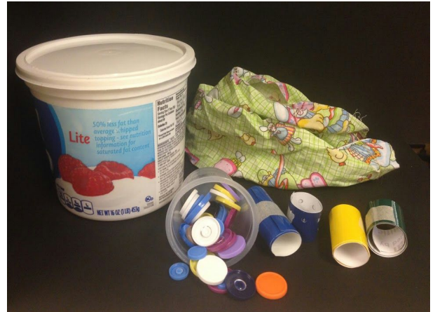
Total Cost for materials in picture is less than $1.00!